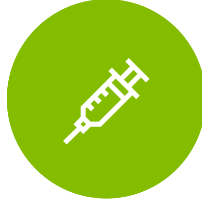
Covid-19 Vaccines and Boosters