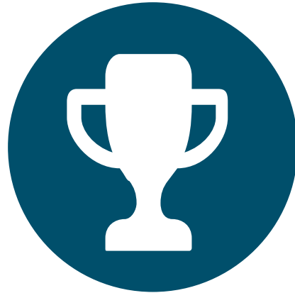
Staunton Group Practice