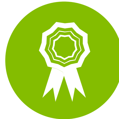
157 Medical Practice