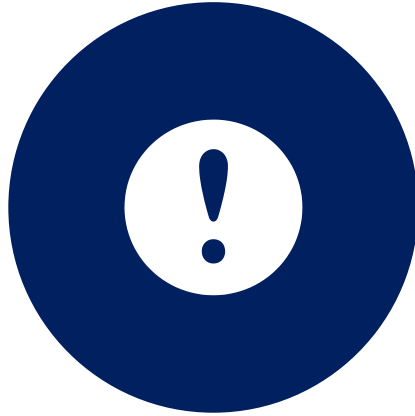
Covid-19 new variant (Omicron)